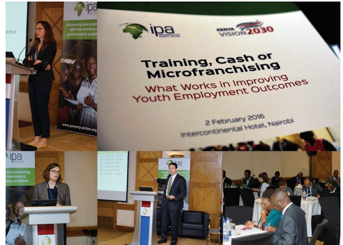
Figure 1: Results Dissemination Conference in Nairobi, February 2016

solution to youth unemployment in this context. Policymakers and researchers seeking to increase youth employment outcomes for women in urban areas might consider whether greater impact could come from trying to expand formal-sector employment opportunities, or through programs that directly target the most likely entrepreneurs.