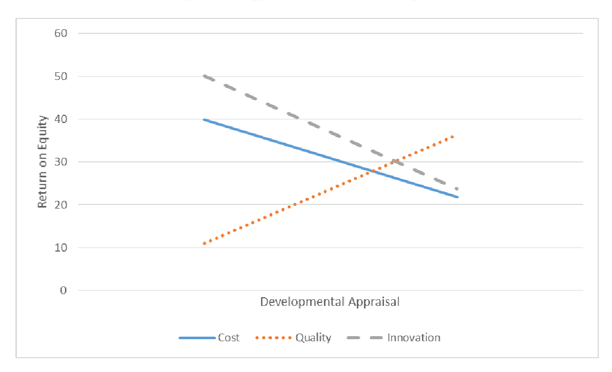
Figure 1. Effects of Developmental Appraisal on Return on Equity, by Strategy