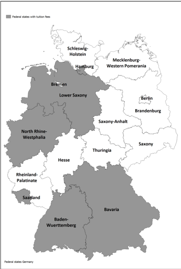
Figure 1: German Federal States Charging Tuition Fees in 2009

Since our data provide information about the treatment and control group before and after the reform, a difference-in-differences approach can be applied. A number of empirical studies have used the same identification strategy for the evaluation of the effects of tuition fees on other outcomes, and have proven that the introduction of tuition fees in some of the German federal states provides a reasonable institutional setting for this estimation approach (e.g. Dwenger et al., 2012, Hübner, 2012, Bruckmeier and Wigger, 2013, Helbig et al., 2012). However, although the change in