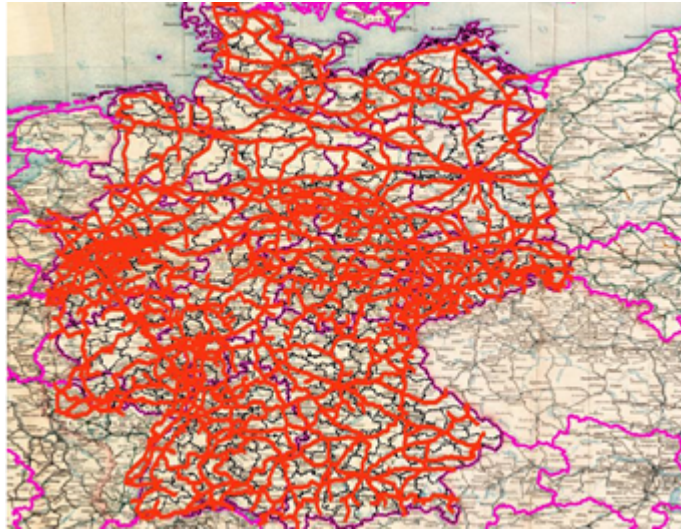
FIGURE 1.— Digitized railroad network from 1890 within NUTS 1 and NUTS 3 boundaries of 2008

Notes: The total length of the digitized net is 28,536 km.