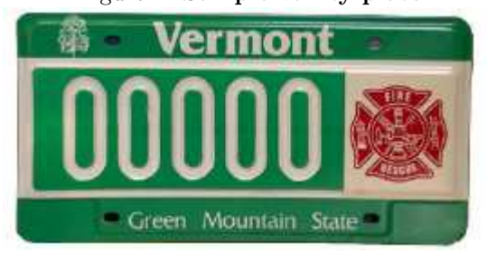
Figure 1: Sample vanity plate