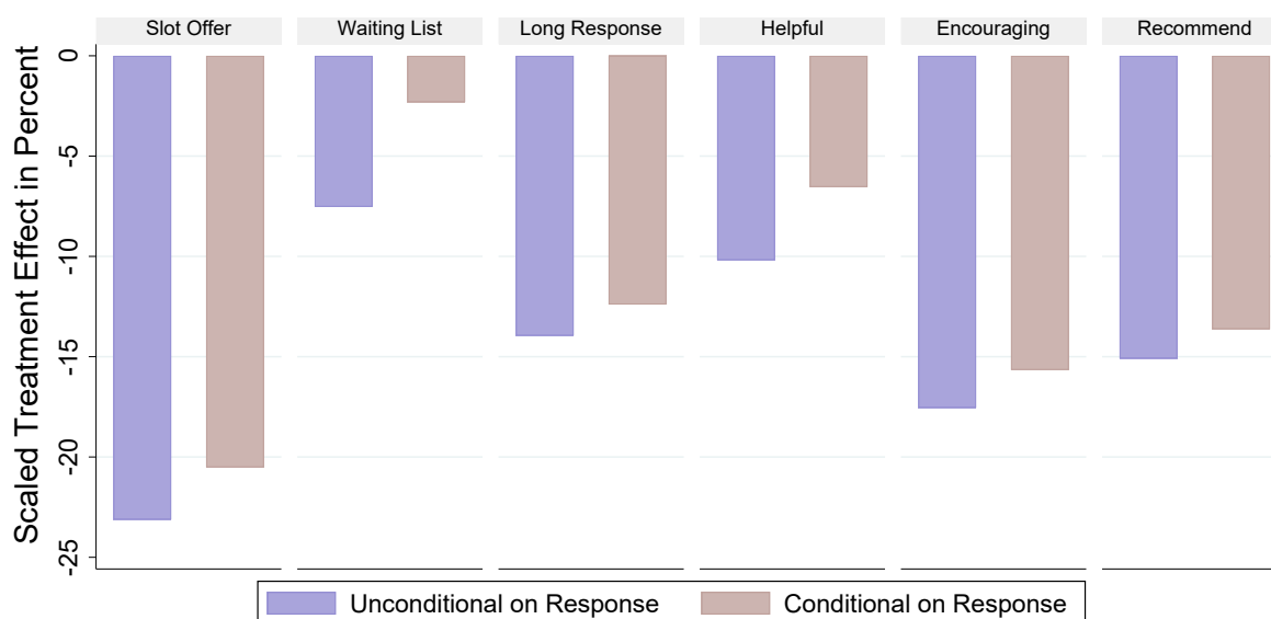
Figure 3: Scaled Treatment Effects on Response Content

Notes: Figure shows scaled treatment effects for email content outcomes, based on the multivariate OLS models shown in Table 3. Scaled treatment effect expresses the treatment effect relative to the sample mean (unconditional on response) of the respective outcome in the native control group.