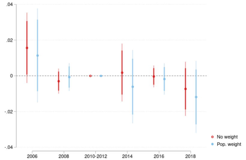
(b) Turnout in High Hisp. v. Low Hisp. Census Blocks

Notes: In each panel, estimates depicted are from two separate specifications: one without weighting (red dots, on the left of each pair), one weighted by Census block population (blue dots, on the right of each pair). Reported estimates are the High [Black OR Hisp.] Block*Covered*[Year] coefficients, estimated relative to the Census blocks in the “Low [Black OR Hisp.]” category. Both include county-by-year fixed effects, Census block race dummies-by-year fixed effects, and Census block-by-midterm fixed effects. Thicker lines depict 95% confidence intervals; thinner lines depict 99% confidence intervals.