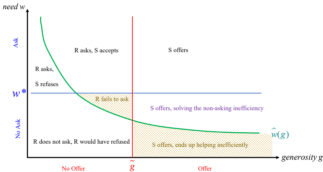
Figure 3: Equilibrium.

doing so, through either an unconditional pledge or after the need is revealed by an ask. Conversely, there is no help at levels of need where S would not want to help: either R does not ask, or he does but S turns him down. 32