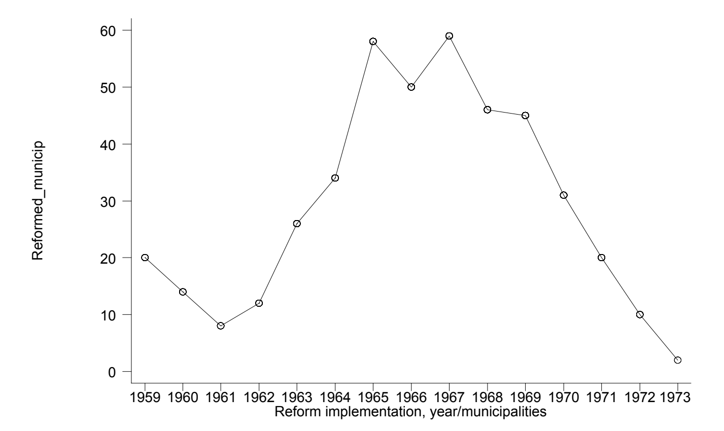
Appendix Figure 1 The Number of Municipalities Implementing the Education Reform, by Year Norway