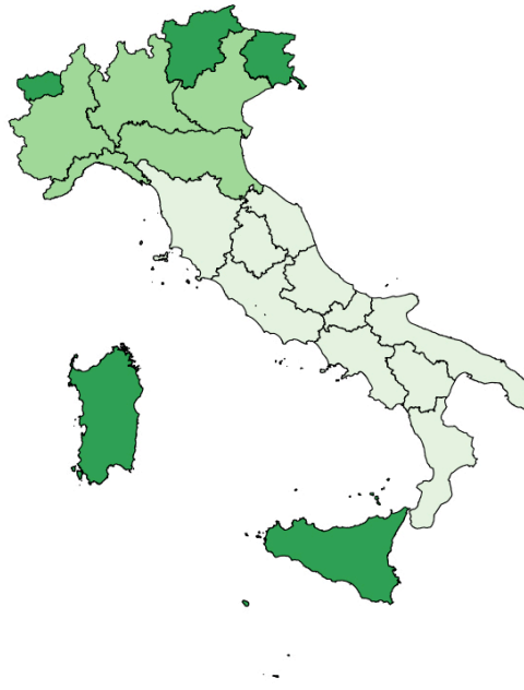
Figure 2. Municipalities in Northern Italy (non-special-autonomy regions). Lega Nord never contested municipal elections (paler), contested elections (darker) and had above-average support in municipal election (darkest)