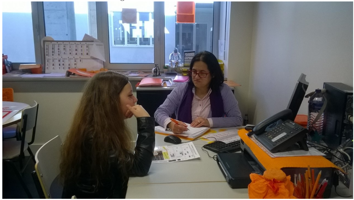
Figure 1: A mediation session

{\bf Notes:} An illustration of a one-to-one mediation session in a participating school.