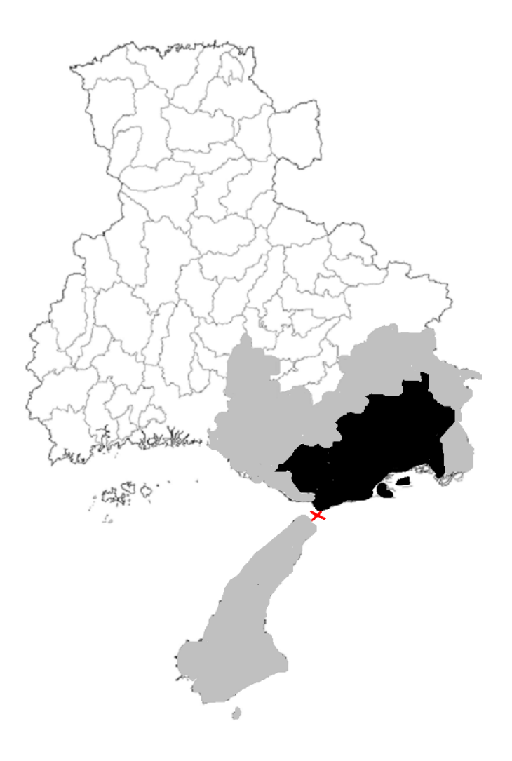
Figure 3: Damaged Areas

Note: Shaded area corresponds to the set of cities which recorded physical damage due to the quake. Among damaged cities, the black area is a subset of cities highly damaged by the quake, while the gray area is a subset of cities suffered from moderate damage.