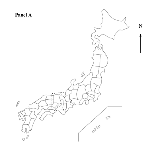
Figure 1: The Epicentre